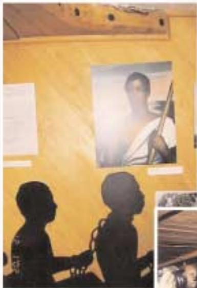
Silhouette, Amistad America Exhibit