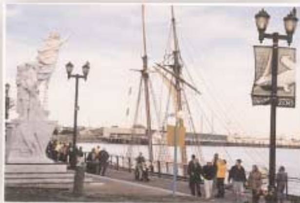
Schooner docked at Woldenberg Park, Port of New Orleans

In addition to the tours of the Freedom Schooner, a variety of events were held before and after the arrival of the Schooner to prepare and educate the community on the history of the Amistad Incident. Five organizational recep-