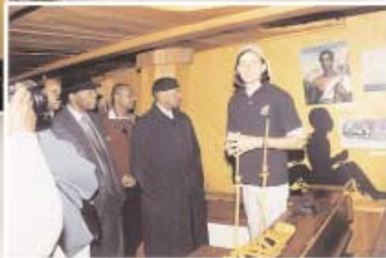
Crewmember of Schooner providing tour