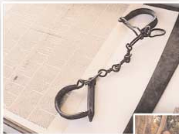
Shackles, Amistad America Exhibit